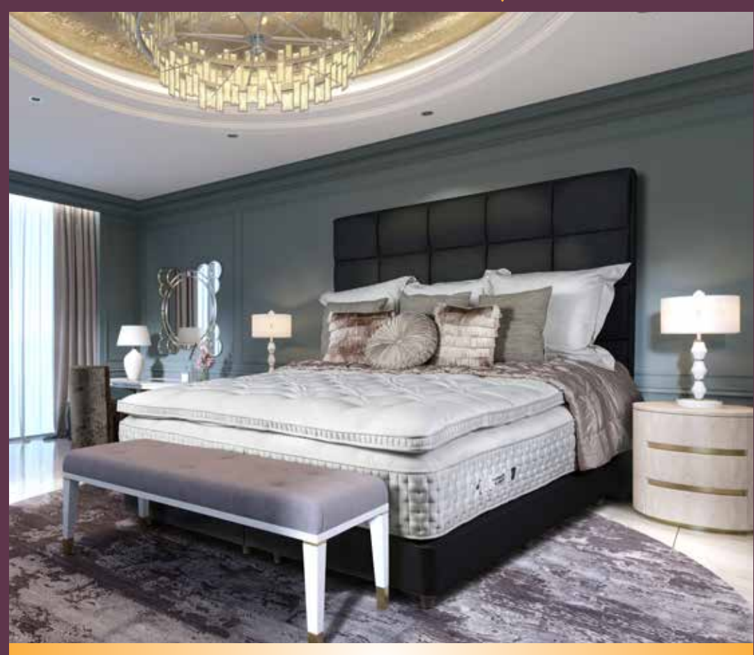
Top of the range, exquisite bed featuring 38500 pocket springs