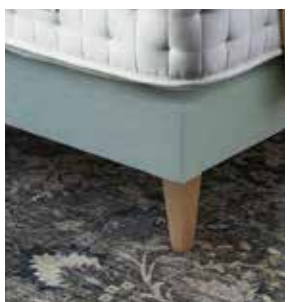
Special sizes and zip & link beds and mattresses available on request. Please ask for more details.