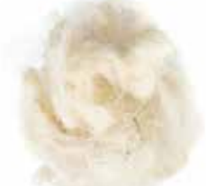
BRITISH WHITE WOOL

With all the same properties of British wool, Yorkshire wool is sourced from local farms.